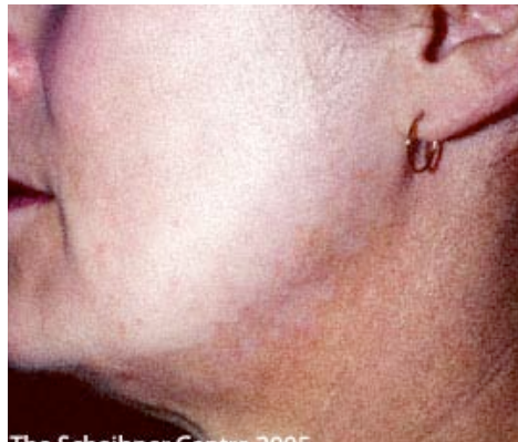
This patient suffered pigmentation loss due to having resurfacing, after repeated treatments, it is substantially better.