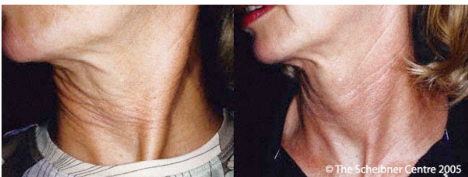
Before and after laser treatment. The unique eternally young method allows treating of necks and body skin previously untreatable by lasers.

In all healing, the genetic code in the cells acts as a blueprint which the body uses as an ideal by which to heal itself. The laser light when used in this unique non-invasive manner acts as a trigger for this healing process. Because it uses the body's own collagen and elastins, the results are subtle and completely natural, reversing the effects of time and sun damage to a great degree. The skin continues to improve even nine to twelve months after the treatment. It is a subtle gradual change, but the end results can be quite dramatic. The forever young treatments are suitable for women and men of all ages. In the young (people in their twenties) as preventative and in the older age groups for the purpose of reversing sun damage and signs of aging.