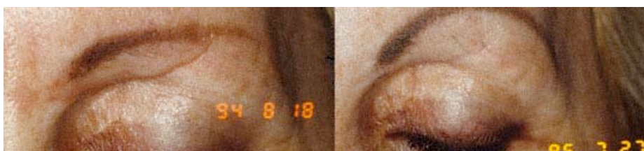
Before and after eternally young laser treatment.