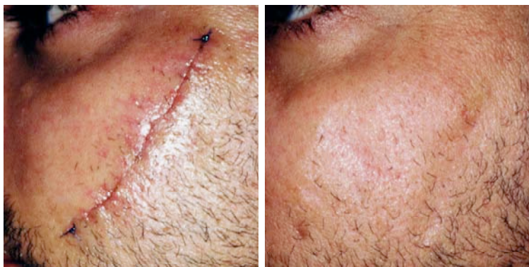
As with surgical scars, the earlier the scar is treated after the accident, the better the results.